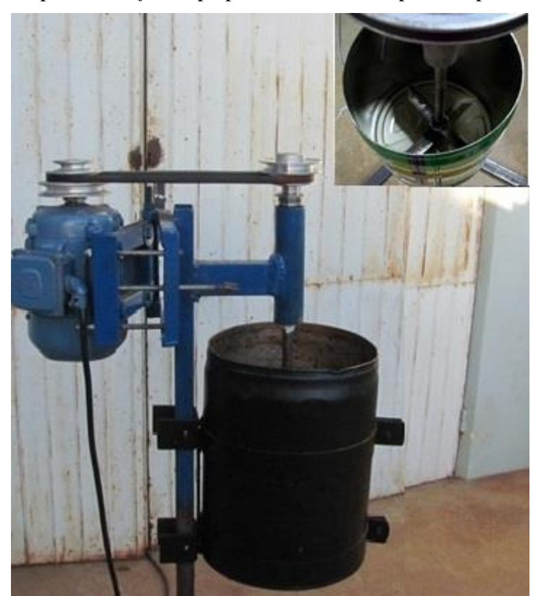
Figure 2. Pulper developed for the jerivá pulp and seed initial separation process

Tests were carried out to adjust the mechanism and develop the pulp separation process. The determination of rotation speed was carried out aided by a contact digital tachometer. Through efficacy and quality tests, the rotation 1,429 min<sup>-1</sup> was defined as the working rotation, and an average 5.09 min processing was necessary to extract the pulp. The rotation 2,830 min<sup>-1</sup> was seen to damage the endocarp and the rotation 755 min<sup>-1</sup> required around 14.39 min. to extract the pulp.